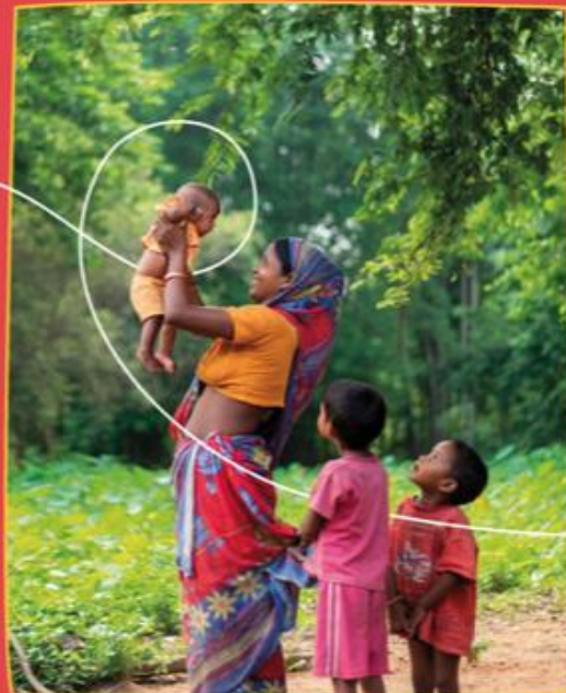
A mother with her children playing outside their home in a remote village in India.

Loving God, We thank you for the gift of our lives and for the life of every person, both near to us and far away. We thank you for the wonder of all your creation. Through fasting, almsgiving and prayer may this Lent draw us deeper into the warmth and light of God's love. May we see the world more clearly, Especially those who are often overlooked. May we come closer to your heart, Which you showed through the cross of Jesus. May we be full of hope for all future generations. We ask this in Jesus' name Amen.