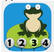
Teaching Number Lines