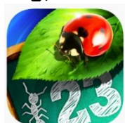
Bugs and Numbers

THANK YOU KOOLAMAN FOR SUPPORTING OUR SCHOOL