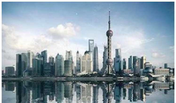
Skyline View of Shanghai